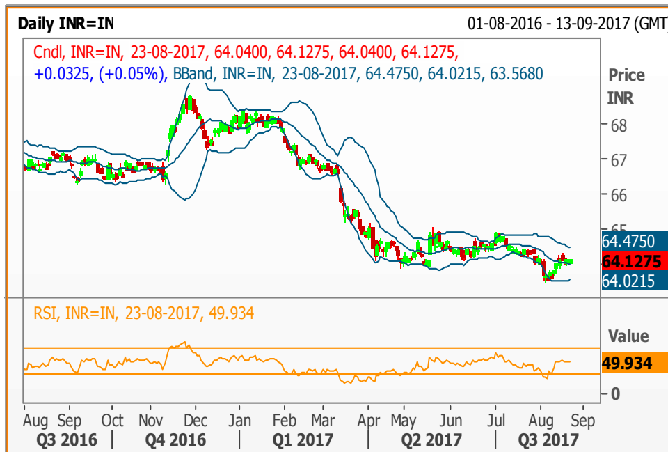
Major Currency Chart