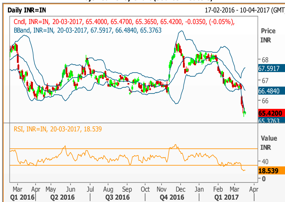
Major Currency Chart