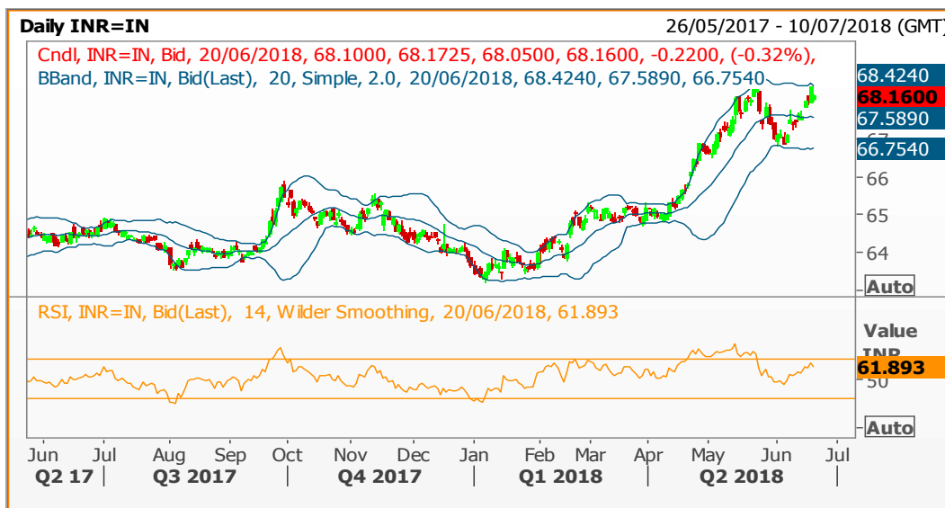
Major Currency Chart