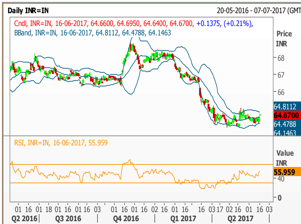
Major Currency Chart