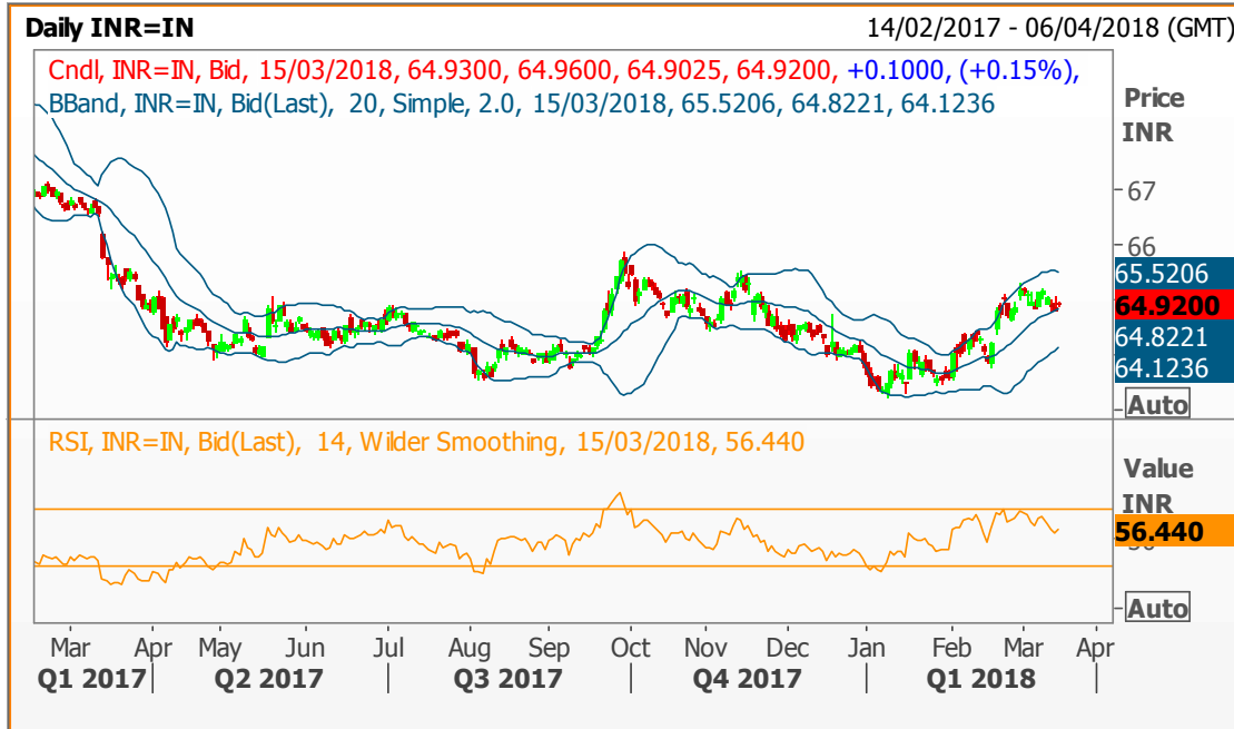
Major Currency Chart