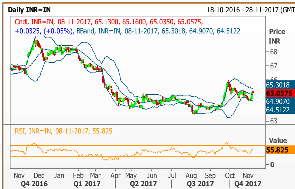
Major Currency Chart