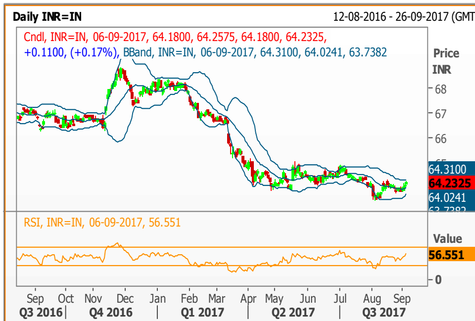
Major Currency Chart